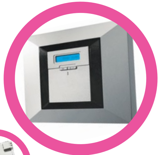
PowerMaxPro Wireless Security System