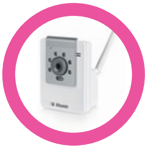
WiFi Network camera