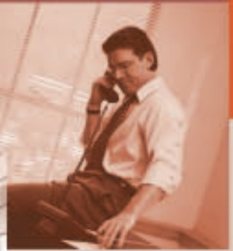
Digital voice messages to private telephones