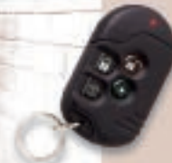
Easy control with press-button keyfob.