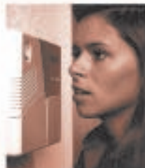
2-Way voice monitoring

Our wireless system makes installation hassle-free with no disruption of your family's schedule. Fast and easy, there's no drilling or running cable through walls; no plaster repairs or painting. Installers are in and out within an hour, and life is back to normal.