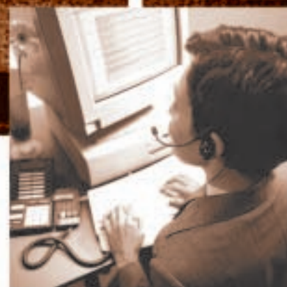
24-Hour emergency monitoring